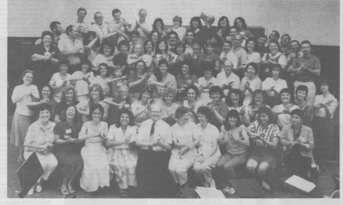
SAY CHEESE—Seventy-five interpreters and deaf brethren from across the United States sign "cheese" during a July 17 to 21 workshop on the Big Sandy Ambassador College campus. Workshop sessions included aspects of sign language, song signing, notetaking and the attitude of service.